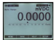
Fast Response time