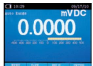
Fast response time