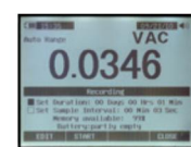
Real-time data Recording