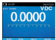
High Resolution & Accuracy